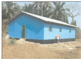
Levuma Church of Christ Front and side view of building, newly painted

Greetings from the church in Sierra Leone to you and our many partners in Ministry. Last night I arrived safely in Monrovia from Sierra Leone. We praise our Lord Jesus Christ that the Levuma Church of Christ building project is completed and painted as you may see in the attached photos. The congregation was very helpful in the construction works on the church building. While in Sierra Leone we were privileged to have leadership seminar with the Elders of Levuma, Mandutawahun and Taway congregations every morning for 4 days. We also had crusade meetings during the evening hours and the Lord blessed his kingdom with 35 lost souls from the 3 villages and surrounding towns who gave their lives to our Lord Jesus Christ. They were baptized and added to the church!!! It is sad to report