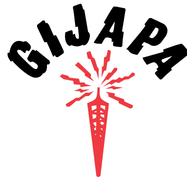
God Is Just A Prayer Away Radio Broadcast Around the World