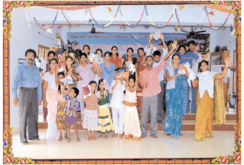
Calvary Church of Christ members holding up pieces of clothing received