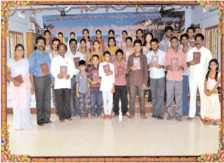
Congregation of Calvary Church of Christ holding up their Bibles they received