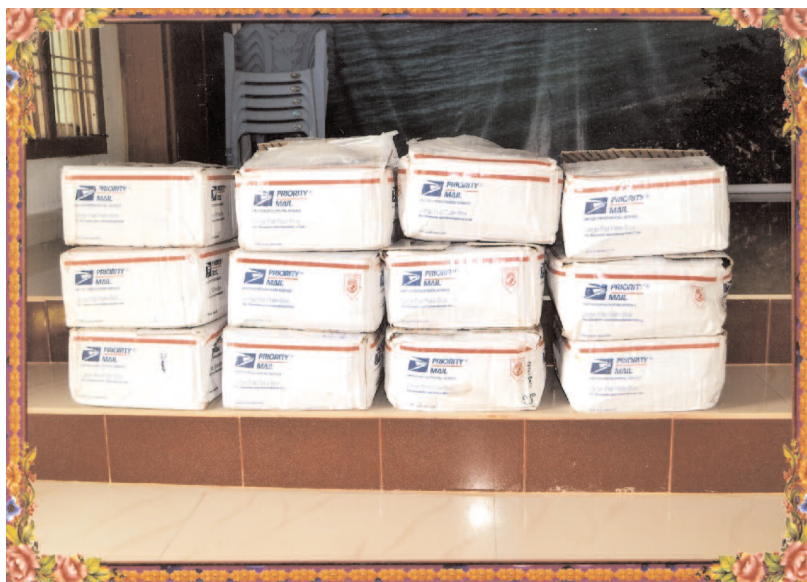
US flat rate boxes used for shipping Bibles and clothes - cost $77.95 ea