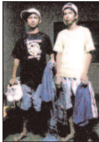
Boys holding shoes and clothes from GIJAPA.