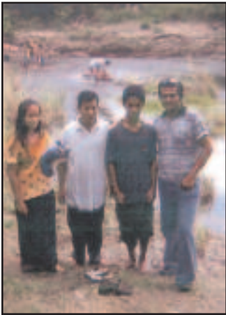
Baptism in background, wearing GIJAPA used clothing.