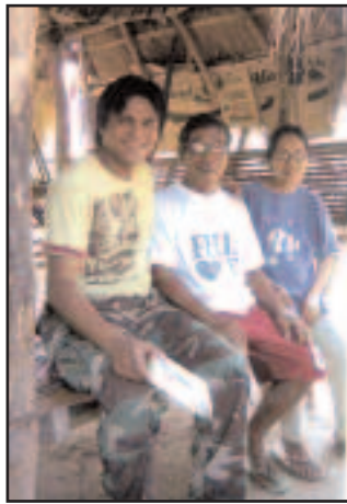
Two people on the right are wearing eye glasses sent by GIJAPA. They were able to read their Bibles for the first time.